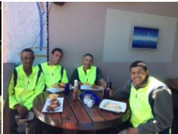
Village Ambassadors Enjoying their "Sponsored Brunch" at Blue Olive

Read more... (George Herald 2 October 2014)