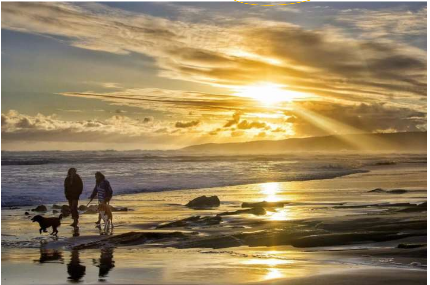
Sunset walk on our wonderful Wilderness beach.